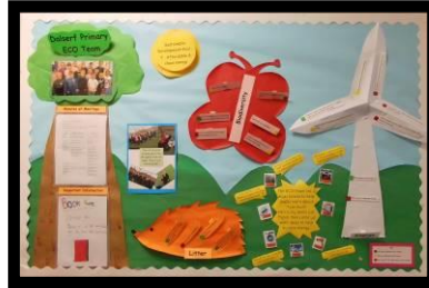
Eco Team Noticeboard

Some of the whole school events we usually participated in are: World Book Day, Safer Internet Day, Fairtrade Fortnight, Earth Hour and Roald Dahl Day.