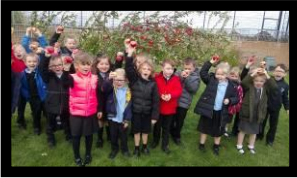
Apple picking in our garden!

Through participating in whole school events and initiatives we are allowing children the opportunity to become responsible citizens and confident individuals and to see how their learning relates to the wider world. We are proud to be an Eco School and we have maintained our status for a number of years. All pupils have a shared responsibility for various aspects of their school environment and their contributions are valued by the Eco Leadership Team.